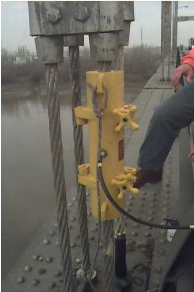
Figure 9 – Bridge Stay Pressure Lubrication – March 2004