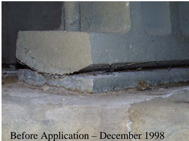
Figure 4 – Rocker Assembly Before Application - December 1998